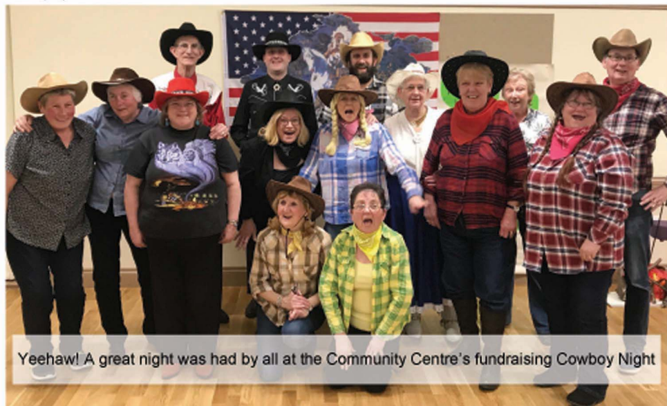
Yeewhaw! A great night was had by all at the Community Centre's fundraising Cowboy Night

www.burnhopecommunitycentre.co.uk Enquiries to burnhope.cc.2017@gmail.com .